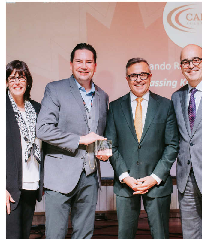
The photo on the left features our team receiving the Environment Award while the photo on the right is for the Safe Handling Award from CN.

Recipients are evaluated based on established criteria, including meeting stringent safety requirements.